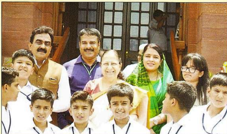
BPS boys with Sumitra Mahajan, Lok Sabha speaker