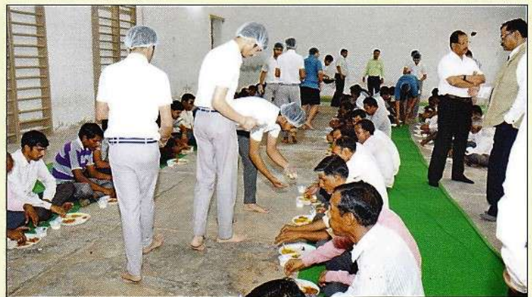
Labour Day: Students serving food