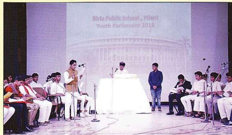
Youth Parliament in BPS

A team of BPS boys visited Parliament of India on 28th July. They interacted with our present leaders to know about the functioning of parliament. The Middle Section Youth Parliament of BPS brought students together to participate in debates, dialogues and deliberations on a host of issues. 20 best students were selected in the two-day event of simulation of Indian Parliament. The young boys proved themselves a reservoir of energy and intelligence during the sessions.