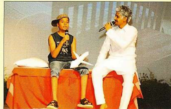
Still from Science Skit