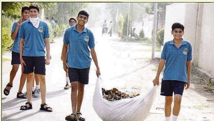
Cleanliness is Godliness