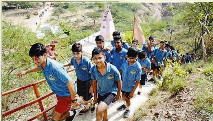
Pahari visit, the local trekking

A group of 8 teachers from BPS attended an educational workshop in The Institute of Sri Sathya Sai Education (India), Dharmakshetra, Mumbai from 21st June to 4th July 2018. The workshop covered topics on teaching-learning, wellness of teachers and students, role of environment and parents in the making of future society.