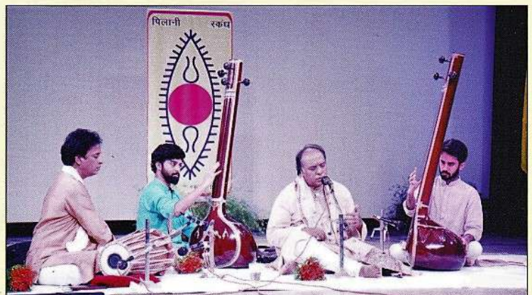
Spic Macay – Presentation by Padmashree Ustad Wasifuddin Dagar